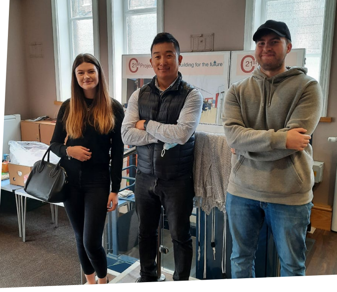
Working with local homeless shelter.